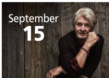
TOM COCHRANE WITH RED RIDER